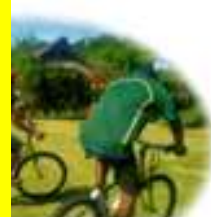
...cles to confirm their bicycle withheld for CMVs two lack