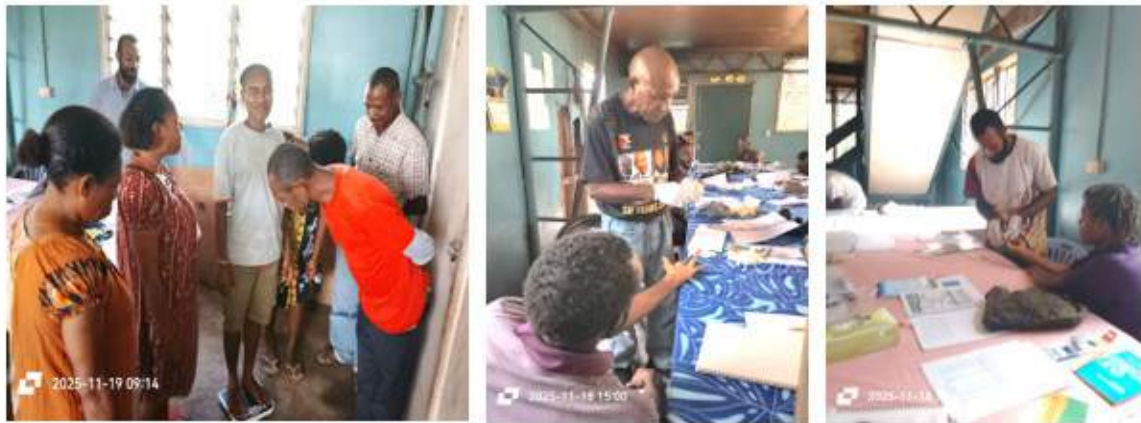
Picture 4: Participants doing practical with weight and RDT testing sessions