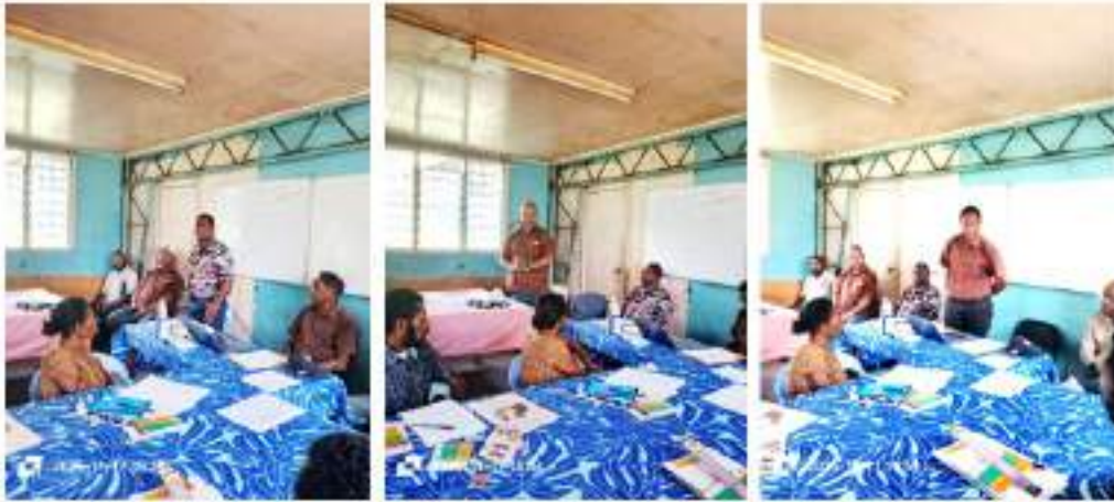
Picture 3: Opening remarks from Popondetta DHM, NMCP Manager & Director Public Health