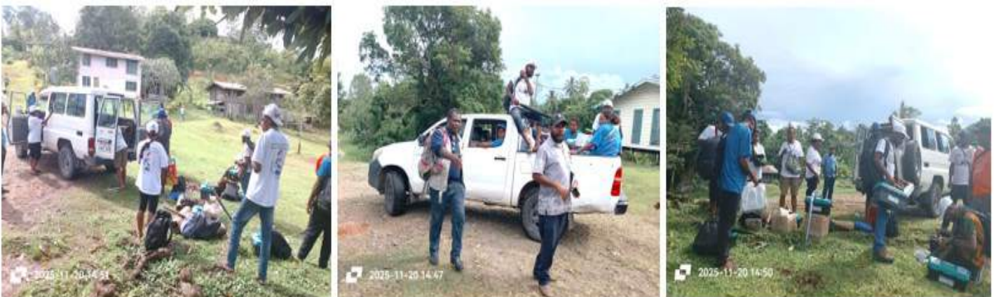
Picture 5: Participants preparing to depart to their respective villages after the closing ceremony