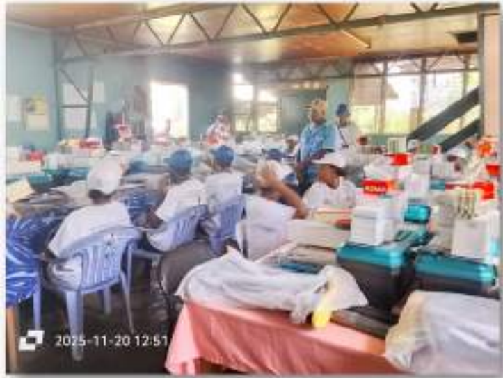
Picture 2: CMVs merchandise allocation in readiness for presentation at the close up ceremony

All in all, the participants enjoyed the concept and appreciated for being selected to attend the training to serve their families and their communities as a whole.