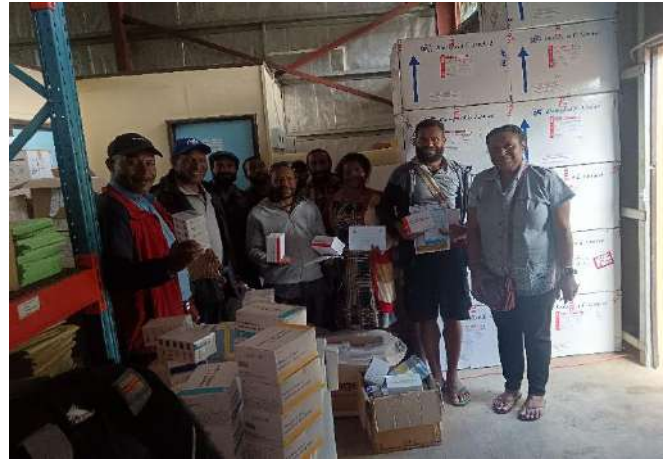
Pic 4: Training on Malaria Refresher training done with Surveillance team for Malaria Outbreak in Maramuni HSC.