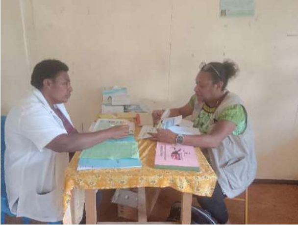
Pic 3: On-Site Training on Malaria Refresher done with Staff at Kepelam HSC.