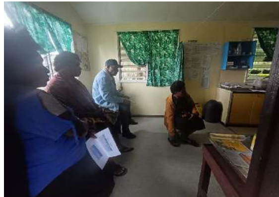
Pic 2: Onsite CQI done with Staff at Topak HSC.