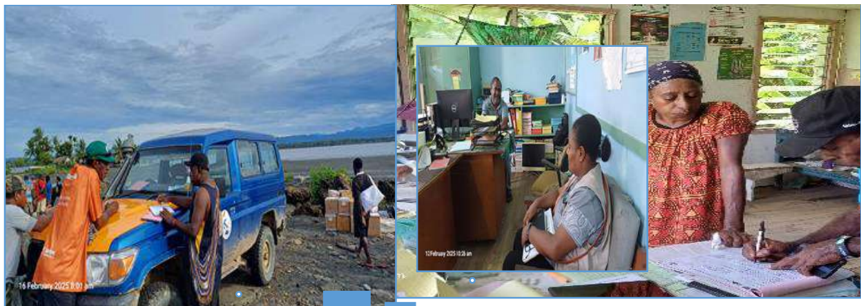
Pictures showing partners engagement in the program, Picture 1 on the left; Kikori district health team taking supplies to Kikori, 2nd picture; meeting with PHIO and 3rd pictures on the right; PDCO traveling with team to some facilities

We met with the new public health director GPHA advising him on our visit and plans. He also updated us of the tribal fights situation on the ground. We were also privileged to have a very supportive Kikori district health team which assisted us transported supplies for Kikori district from Kerema and did the distribution to all the 4 accessible health facilities there. We also met with PHIO who assisted us to clean our database for CM2a.