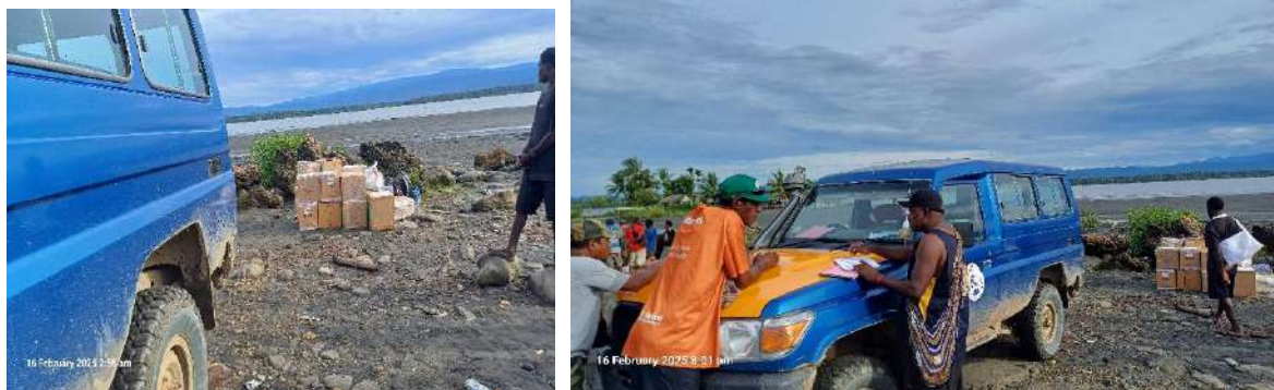
Signing off supplies for Kikori district to the district health team to assist with distribution