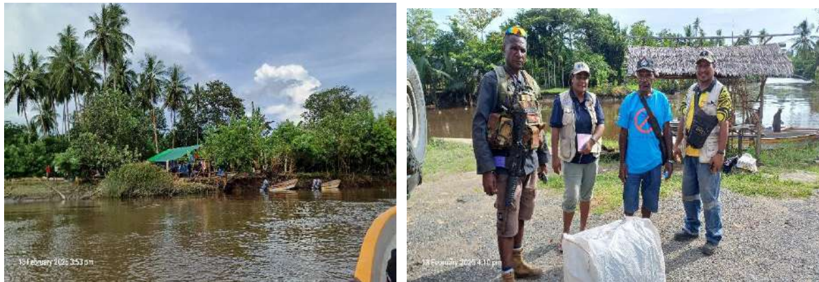
Water Police camping out at Sapearo along the river side which will be receiving the nets