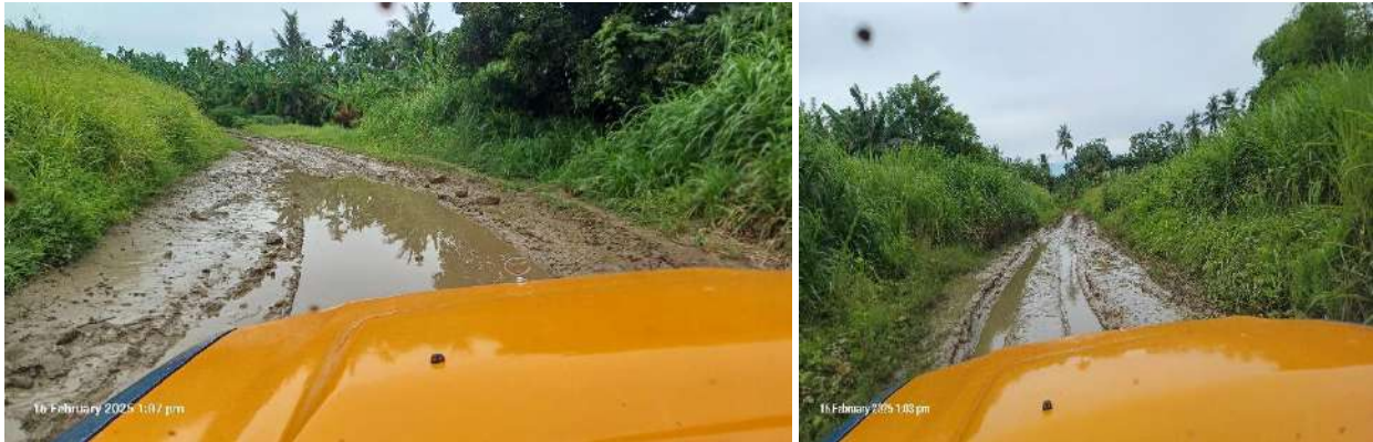
Some challenges _ Bad roads leading up to Iokea