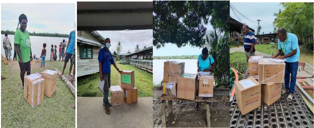
Kikori supplies well received with GDNs signed off for Karaulti, Kikori, Baimuru and Kapuna