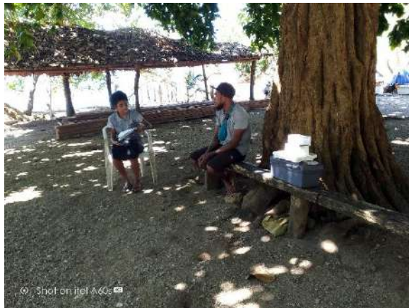
HMMO and CMV at Biwa village

HMMO carried out supervisory visits to road side area and the Rabaraba area. There were no new CMV training conducted. Working in partnership with PHA for the Village Health Assistant (VHA) follow up visit which will be conducted in quarter two