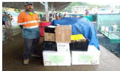
Malaria supplies ready to be loaded on the boat (Alotau Wharf)

Most Malaria commodities were freighted on Small boats the usually travel weekly to the designated districts. District staff are contacted via Malaria What's App group who receive the drugs on site before RMC or PMS visit.