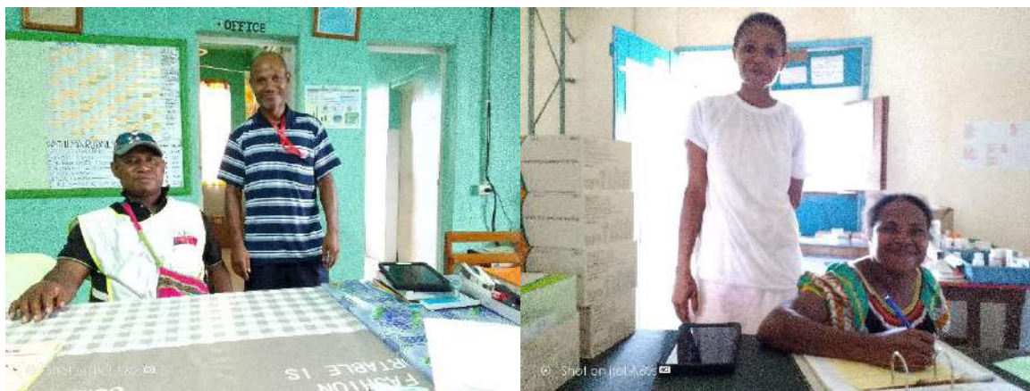
Bolubolu and Watuluma Staff