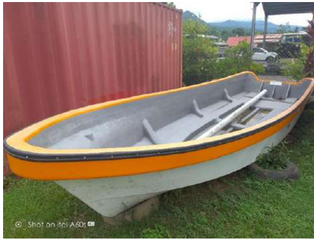
24 Foot Dinghy