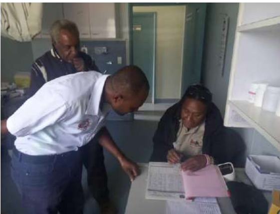
Pic 7. Training done at Tukasanda CHP. RMC explaining to OIC how to record correct positive cases on the Malaria Register.