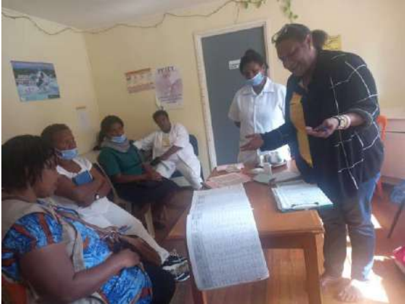
Pic 5. RMC explaining IPTP doses and importance of recording the 3 doses in ANC register.