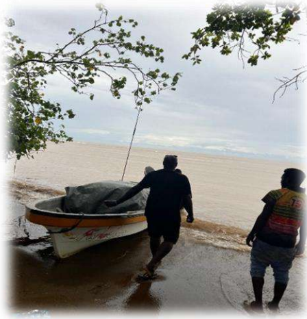
Confirming and unloading Drugs with Health Facility Staffs at Lavongai HC beach front.