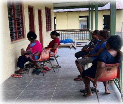
4 pictures above show Students and Teachers at Lemakot School of Nursing during the Malaria Refresher Training