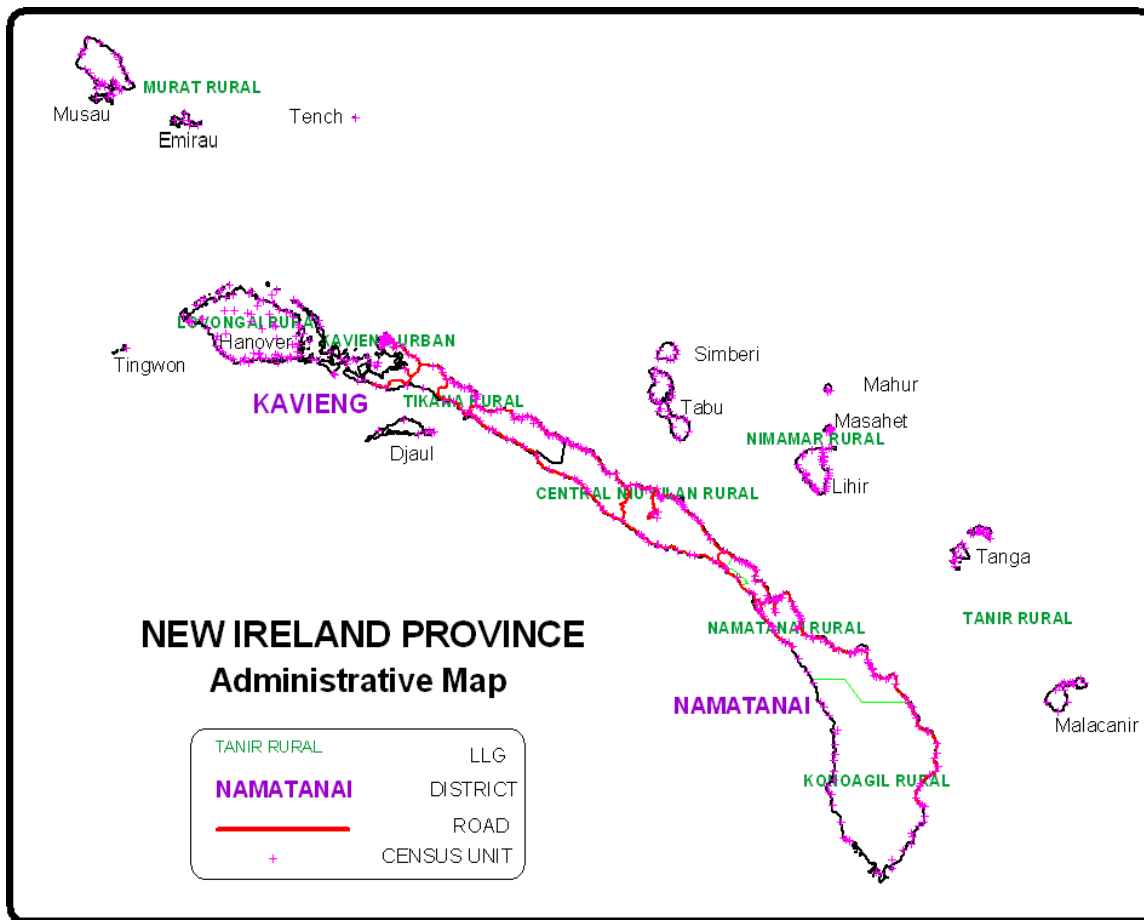
Figure 1.1 This is the map of New Ireland Province.

most of who live in the south of the Island. New Ireland Province is one of the province located in the New Guinea Islands Region of Papua New Guinea. It is about 9557 square kilometers in size and 1400m above sea level. The province has 2 districts (Kavieng and Namatanai) and 10 LLGs, 4 LLGs (Morat, Lavongai, Kavieng Urban and Tikana) in Kavieng District and 6 LLGs (Tanir, Nimamar, Namatanai, Konovagil, Matalai and Central) in Namatanai District. There are a total of 33 Health facilities in the Province, all 33 HF are functioning and there are 86 Aid Posts that caters for all the Islands population, 15 of the health facilities are accessible by road and 19 by boat. Total of 11 Health Facilities are Church run, 7 under Catholic Health Services and 4 under United Church Health Services. There are 3 Private Company Clinics and the rest of the 19 Health Facilities are all Government run.