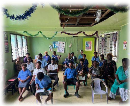
Pictures taken during the Malaria CQI training at Namatanai District Hospital MCH Room.