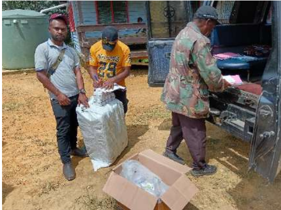
Pic 1- Delivering supplies to Kup HF. OIC signing off to receive supplies.