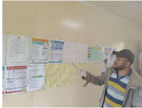
Pic 2: OIC showing all printed treatment protocol placed on the wall at the outpatient.