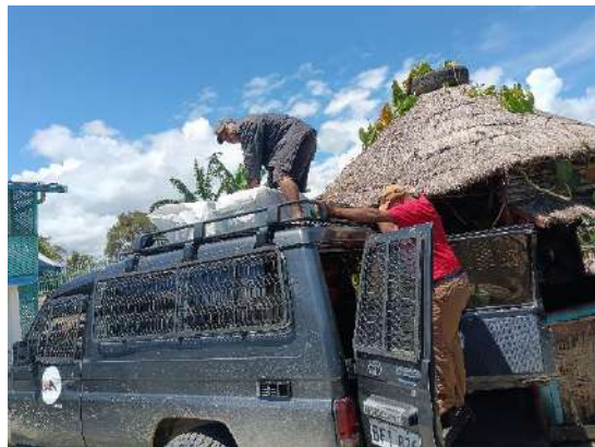
Pic 3: Loading ANC nets at Airport Resort, Mt Hagen.