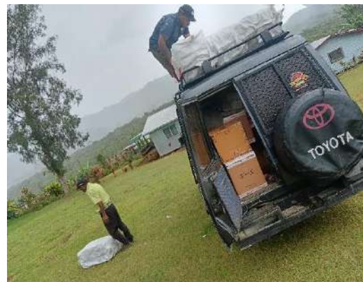
Pic 4: Unloading Malaria Supplies at Williame HC.