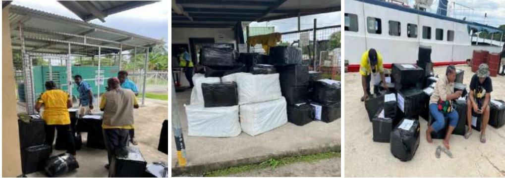
Wrapping and consigning drugs for all the Health Facilities in Pomio District. Picture 1 at Butuwini Provincial Store, Picture 2 cargoes ready to be loaded on RAMS shipping bound for Palmalmal & Picture 3 at Palmalmal wharf waiting for vehicle to pick up the cargoes.