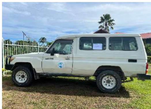
Old Program Vehicle

Vehicle used: RAM Program Vehicle RAQ 619