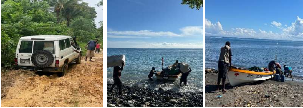
Picture 1 on the highway from Baining to Wide bay and Open Bay our vehicle got stuck because of bad road condition, picture 2 is at Klampun Ward, East Pomio LLG, Villagers assisted the team with loading the dingy with drugs and mosquito nets for Guma, Hoiya and Marunga HC distribution & Picture 3 at Kokopo ready to take off to Duke of York Islands for Molot and Vatnabara HF Visit.