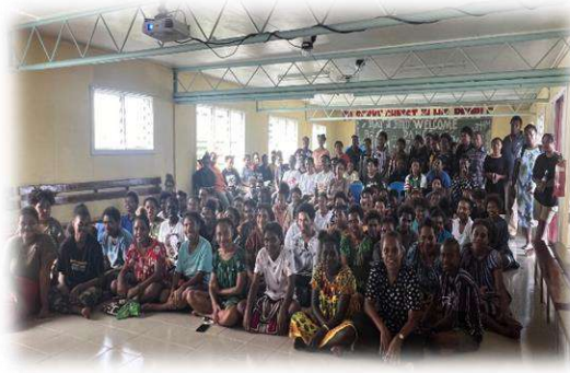
2 pictures above showing Nursing students at St Mary's School of Nursing during the Training.