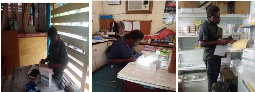
Provincial Malaria Supervisor in action during the Health Facility Supervisory Visit in Q2