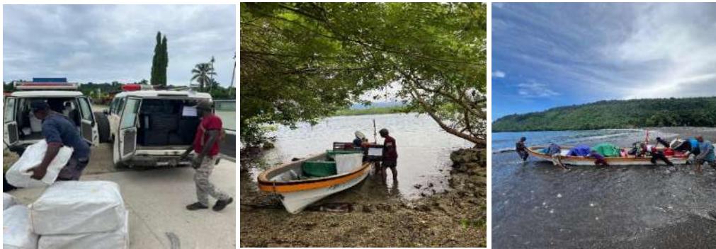
Picture 1 loading drugs and nets on 2 vehicles (EPI & Palmalmal RH Ambulance) at Palmalmal wharf, Picture 2 loading drugs for Uvol HC distribution & Picture 3, PMS & Dingy Operator assistant with the help of the Villages at Bain Ward East Pomio LLG pushing the dingy back to the sea after HMM supervisory visit.