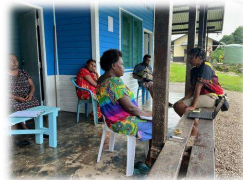
2 Pictures above shows Malaria CQI Training done at Uvol Health Centre