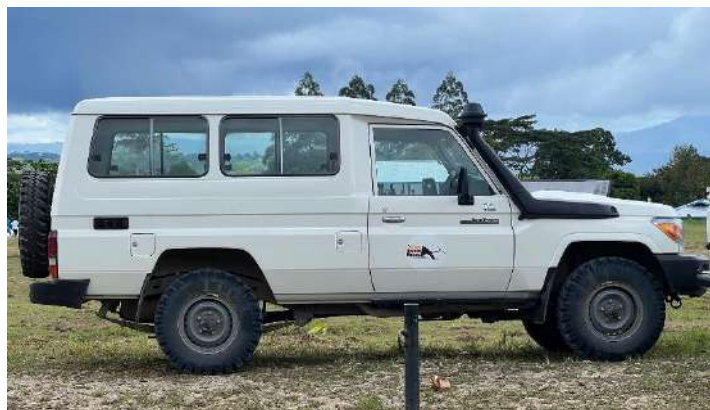
New Program Vehicle

RAQ 612 is out of Ela Motors and ready for shipment to POM