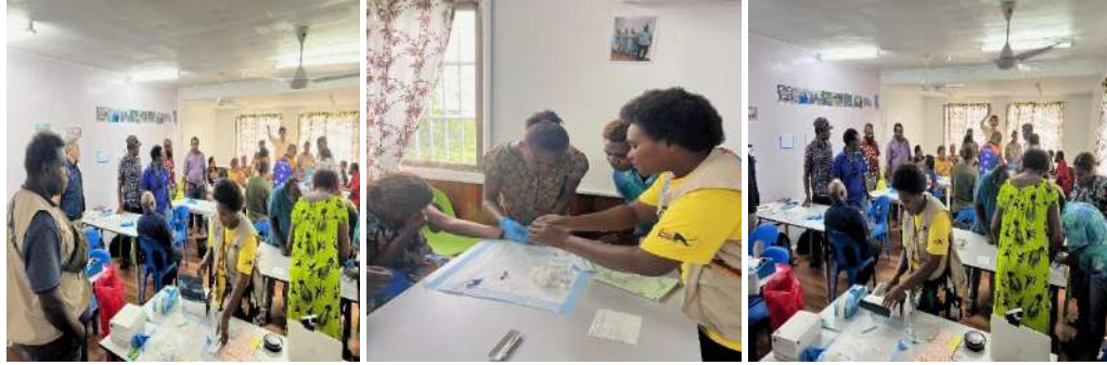
Team attended the SOP for IDA Impact Survey for Filariasis conducted by IMR, WHO & JICA at Burnet Institute Conference Room.