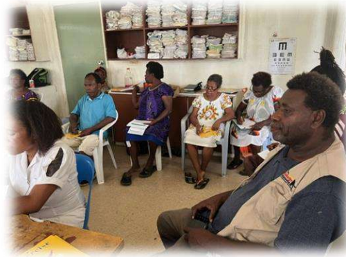
2 Pictures above shows Malaria CQI training done at Palmalmal Rural Hospital