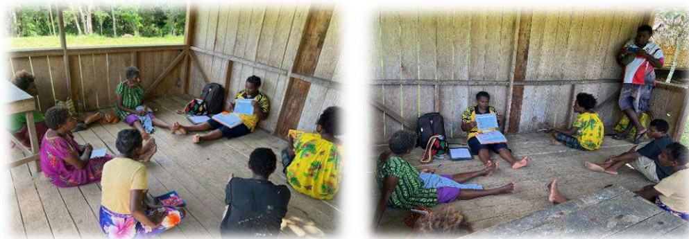
Refresher Training for CMVs done at Hoiya HC for CMVs under Hoiya HC catchment Wide Bay, Pomio District

Pictures above shows Community Malaria Volunteers (CMVs) receiving their Certificates as well as their working materials (Gumboots, T-shirts, malaria flip charts, hand sanitizers, RDTs and ACTs). Picture 1 is at Maskikle Ward, picture 2 is at Bain Ward and picture 3 is at Lop Ward, this CMV had to use her canoe to paddle out to the team on the dingy because of no proper bay for the dingy to go in, all in East Pomio LLG Wide Bay. All these CMVs are under Guma HC catchment area, meaning all their reports will go to Guma HC and they will also receive their ACT and RDT supplies from Guma HC.