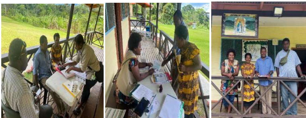
Picture 1 went through on how to do malaria data entry using the ENHIS table, Picture 2 HMMO went through the different types of RDTs, Picture 3 HMMO, PMS and 2 CHW at Raunsepna HSC, Gazelle District.