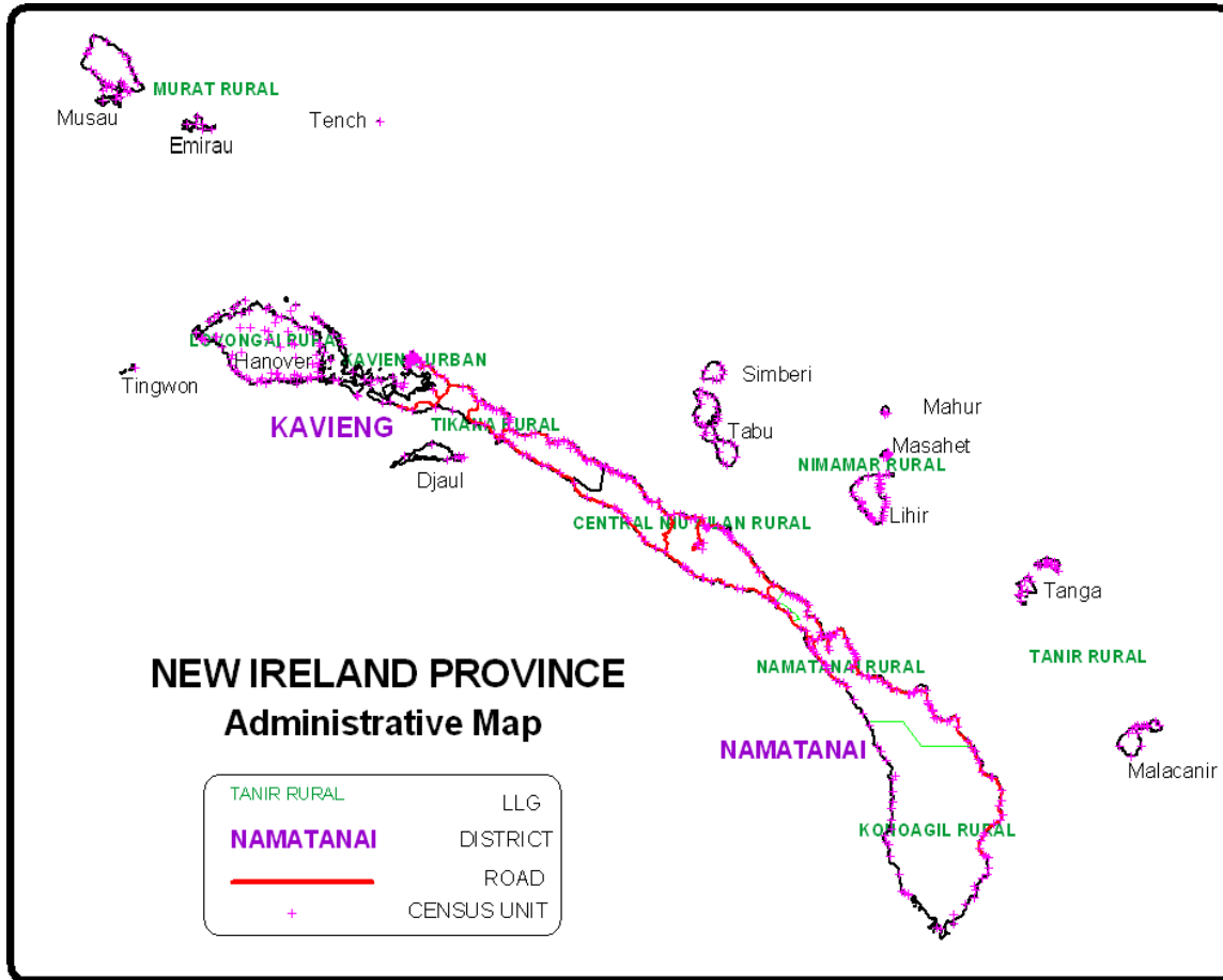
Figure 1.1 This is the map of New Ireland Province.

Matalai and Central) in Namatanai District. There are a total of 33 Health facilities in the Province, all 33 HFs are functioning and there are 86 Aid Posts that caters for all the Islands population, 15 of the health facilities are accessible by road and 19 by boat. Total of 11 Health Facilities are Church run, 7 under Catholic Health Services and 4 under United Church Health Services. There are 3 Private Company Clinics and the rest of the 19 Health Facilities are all Government run.