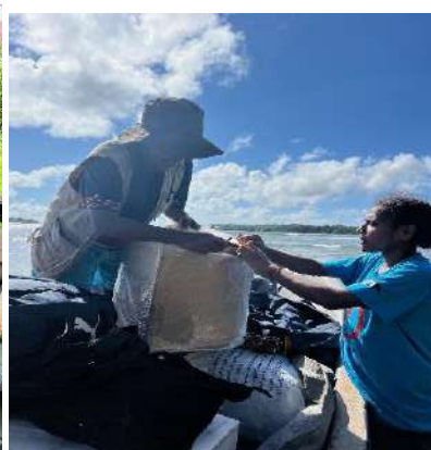
New Hanover Island Trip. Picture 1 is at Taskul HC beach front, going through the checklist with the PMS, Picture 2 is at Lavongai HC, confirming the drugs and the back is the PMS going through the ANC registers with the Nurse who was present during the visit and Picture 3 is at Puas HC beach front unloading the drugs with the Malaria Data Entry Clerk who joined the Team during the visit.