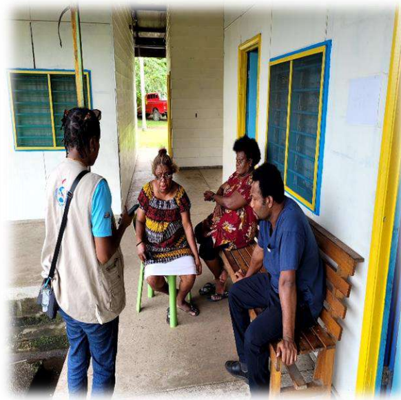
Picture 1 is at Tapo HC going through the Fansida IpTP record keeping books and Picture 2 is at Butuwin Urban Clinic discussing Malaria Clinical Diagnosis with the SIC and her two Health Workers.