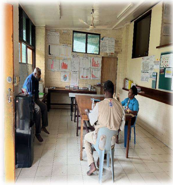
Picture 1 is at Gaulim HC, PMS updating their Stock cards and the HMM M&E going through the ANC register book and Picture 2 is at Gelegele HC during the Q3 visit.