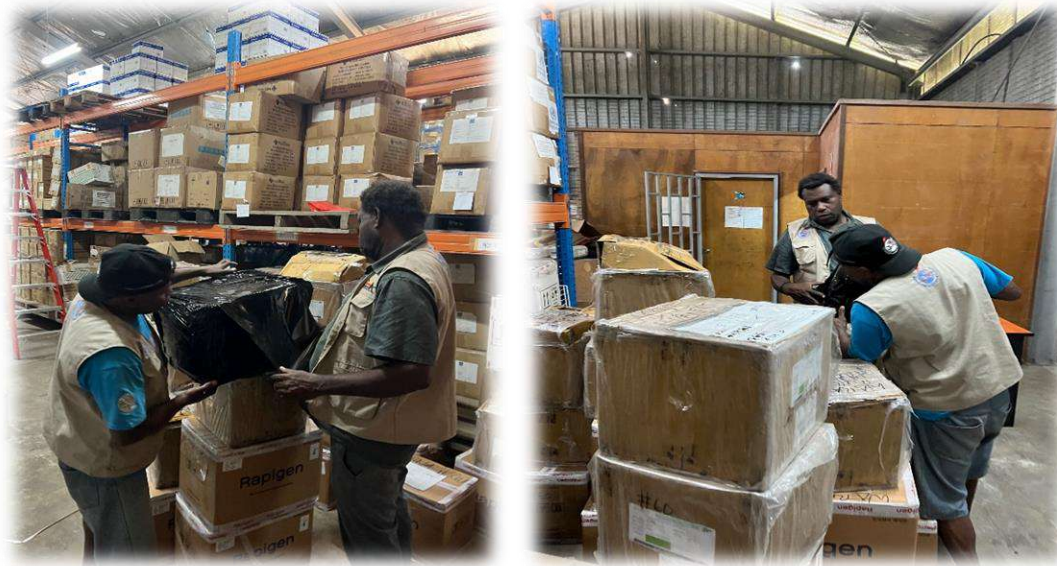
Picture 1 & 2 Black wrapping drug supplies for all HFs in Pomio District at the Transit Medical store by the Provincial Malaria Supervisor and the Malaria Driver.