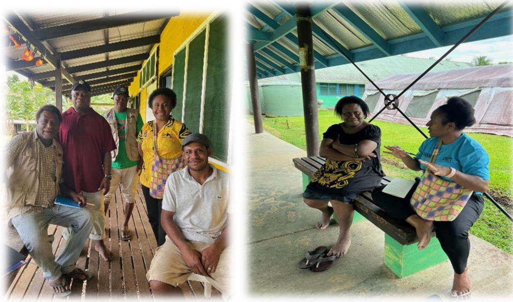
Picture 1 is at Mungou HC during the HF visit and HMM M&E Visit & Picture 2 is at Warangoi RH, HMM M&E officer discussing HMM program with the HEO/OIC.