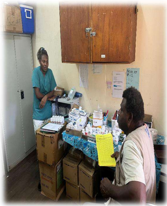
Picture 1 is at Raunsepna HSC, PMS updating their stock cards & Picture 2 is at Rabaul Urban Clinic, PMS emphasizing on stock management to the CHW who is looking after the dispensary.