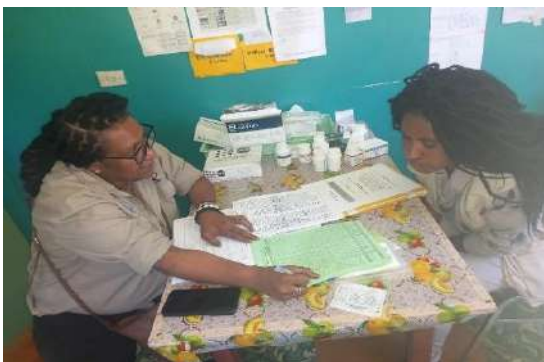
RMC Explaining to OIC -Londor HSC how to correctly fill out Malaria Section on NHIS Reporting forms.