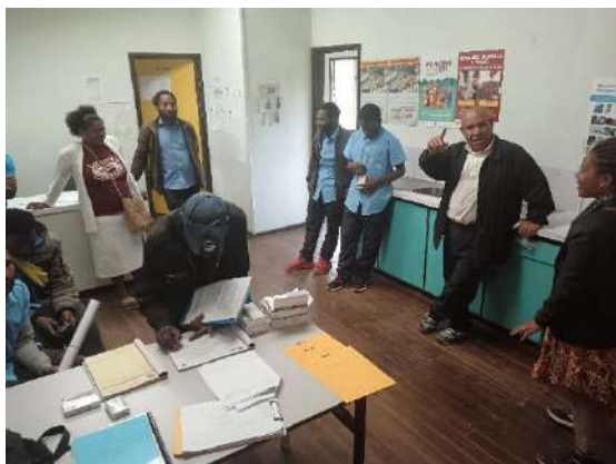
Stock cards included in CQI Malaria Refresher training at Kandep District Hospital.