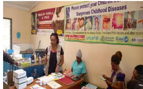
Malaria Refresher training done at Yalis HSC.