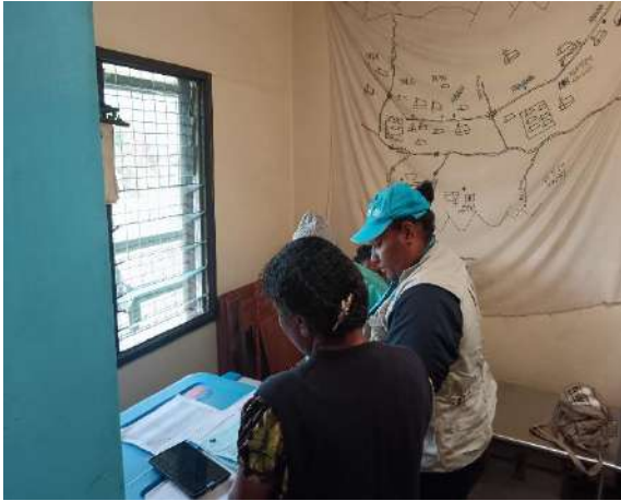
UNICEF Officer doing training with OIC for Yalis HSC.