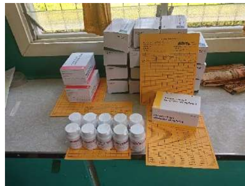
Stock Cards filled out at Londor HSC.