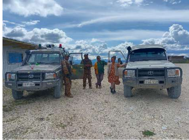
PNGDF Team Medics escorting team to Kandep District. Photo take somewhere between Kandep and Laiagam District