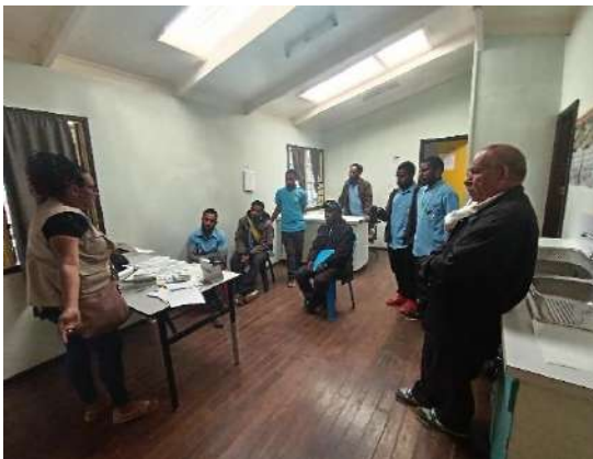
RMC doing Malaria Refresher training at Kandep District Hospital