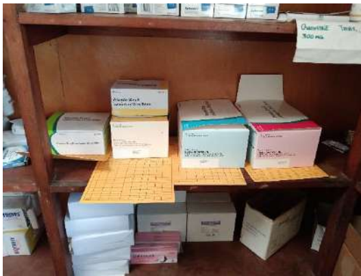
Stock cards filled out at Yalis Health Sub-Centre.