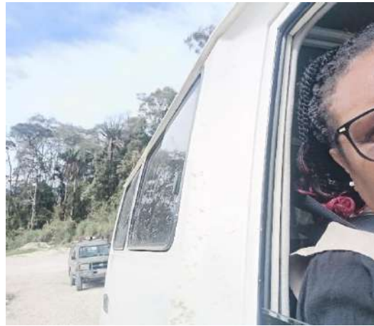
Picture taken during our trip to Kandep. PNGDF vehicle escort at the back.