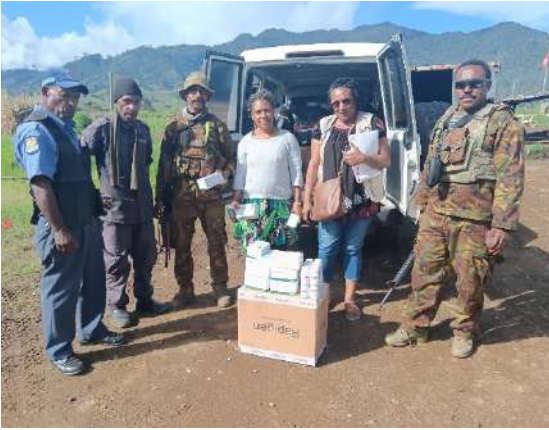
Supplies given to PNGDF Ops. Wanio Medics Team. Photo Taken at Checkpoint at Akom.