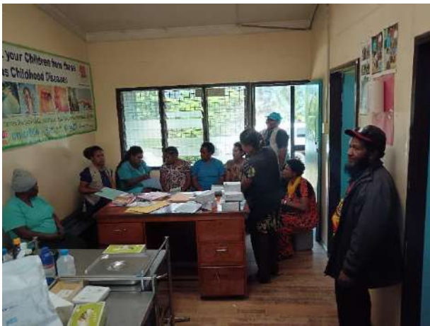
Q & A sessions and further discussions with staff.