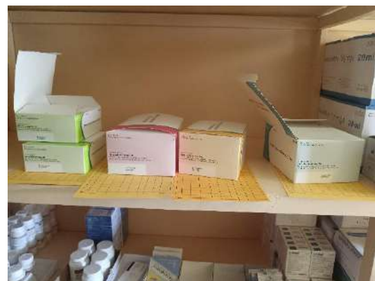
Stock cards filled at Yampu Health Centre