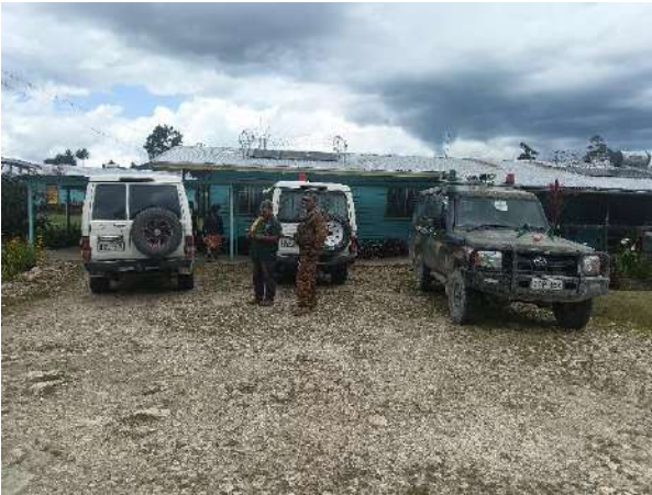
PNGDF with team at Kandep District Hospital.