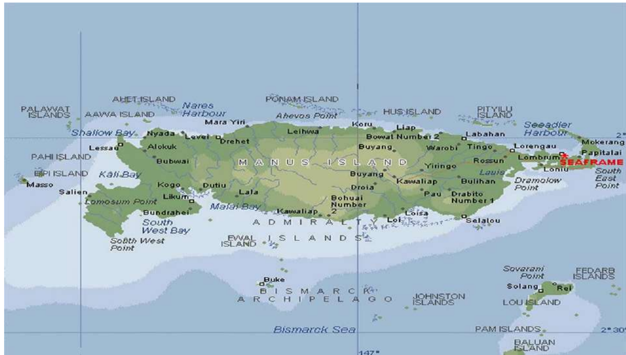
Figure 1. Map of Manus Province

Manus has a single district which contains of one urban (Lorengau) and eleven rural local level government (LLG) arears. Manus district has the highest number of LLGs than any other districts in Papua New Guinea. For census purposes the LLG arears are subdivided into wards and those into census units.