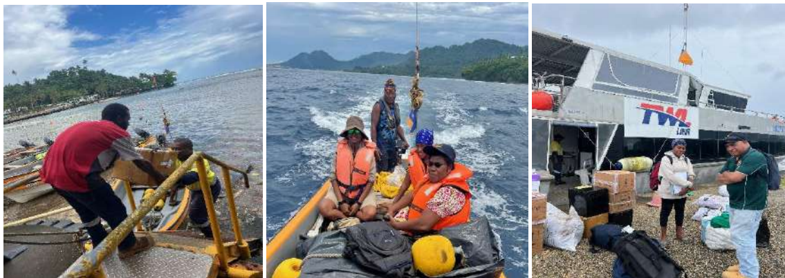
Picture 1 to 3 are all taken at Lihir Island. Picture one shows the Superintendent for Community relations Newmont who assisted the team to load drugs for Masahet HC on to the Newmont contract dingy. Picture 2 is taken during the trip to Masahet Island with the PMS and the LLG Health Manageress for Nimamar. Picture 3 is taken at Londolovit wharf when the team arrived from Namatanai on the Newmont Ferry.