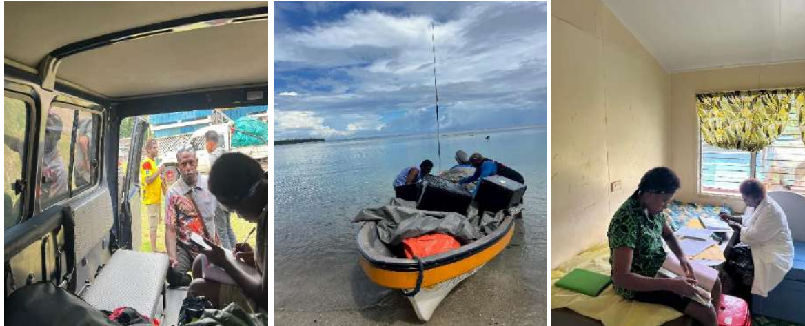
Picture 1 is taken at Muliama, PMS signing off GDNs for Silur HSC, drugs were given to the Logging company Team to assist with the delivery to Silur HC. Picture 2 is taken at Kavieng Hospital beach front, the dingy operator and his assistant loading the dingy for Lavongai Island Trip. Picture 3 is taken at Piliwa HC, PMS and SIC going through the Malaria Reports.