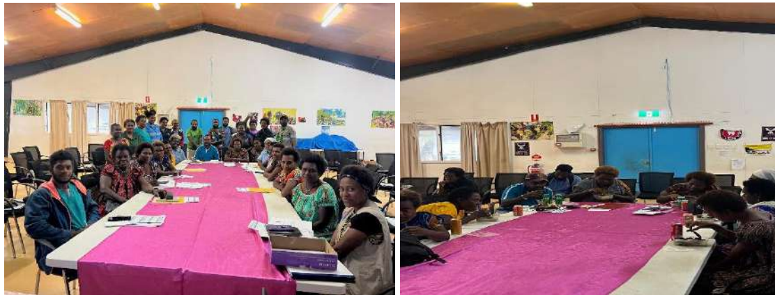
Picture 1 & 2 is taken during the Malaria CQI training for all the Health Facility Staffs on Lihir Island.