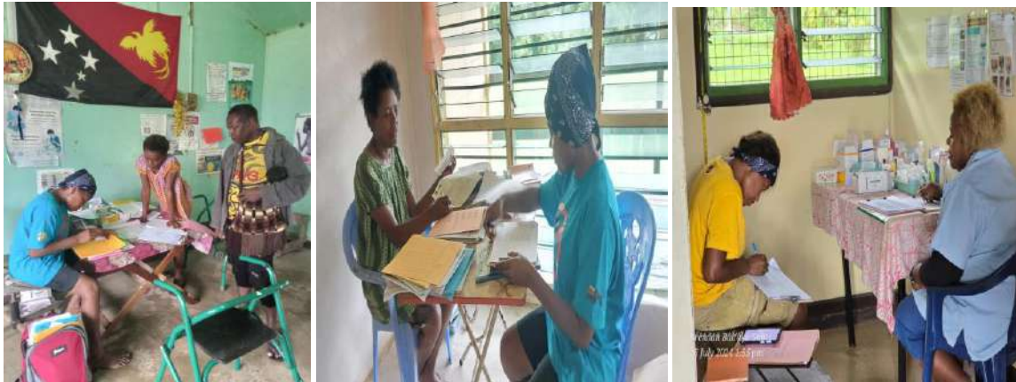
Picture 1 shows the Team at Lamassa HSC during the Q3 HF Supervisory Visit and Drug Distribution, Picture 2 is at Pukpuk HSC and Picture 3 is at Kabanut HSC.